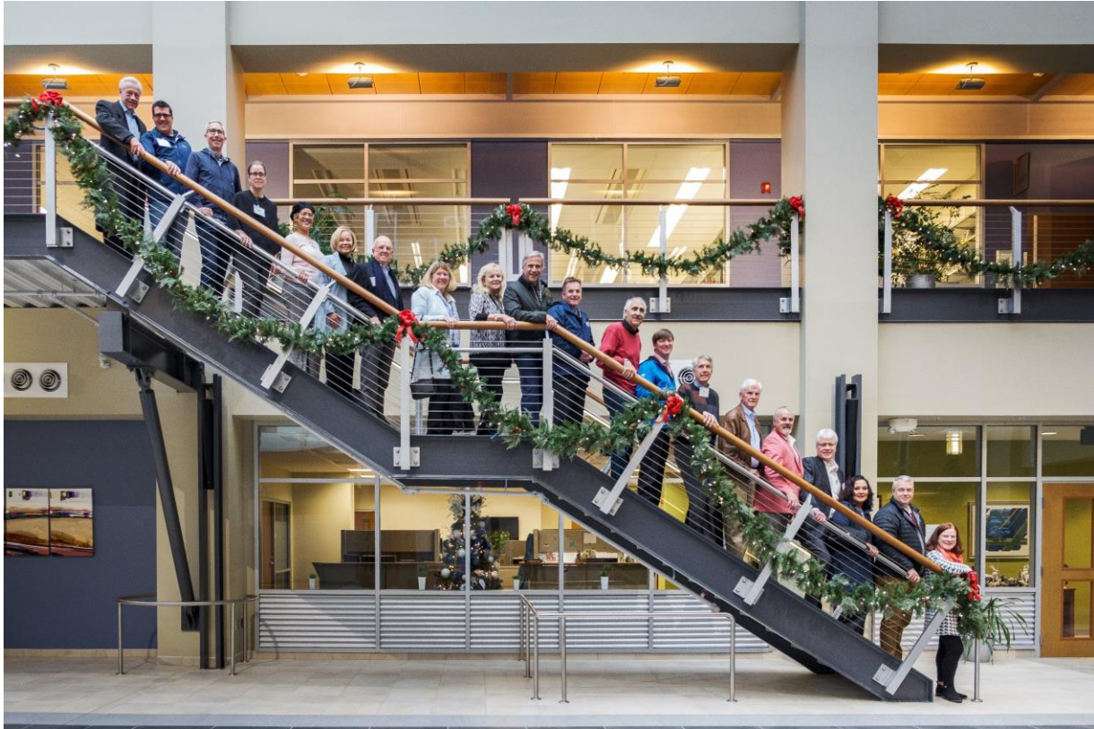
Group photo of the Metro Mayors Coalition at Winston-Salem and Wake Forest University's Innovation Quarters