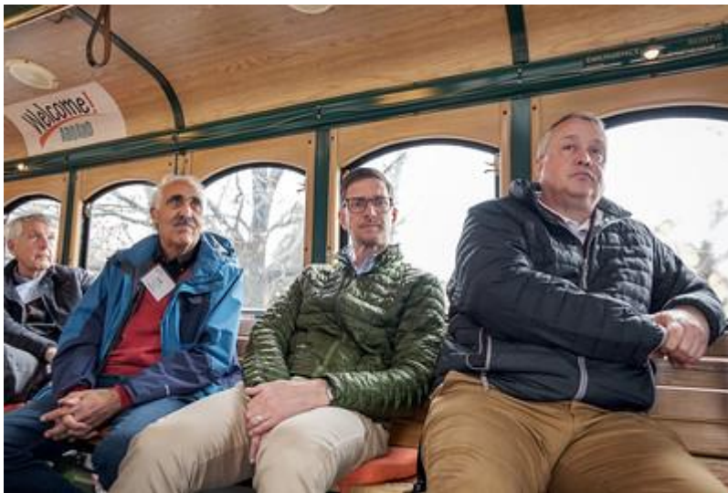
Metro Mayors toured Old Salem and downtown Winston-Salem – learning about efforts to encourage the arts, entertainment, entrepreneurship, new businesses, and affordable housing