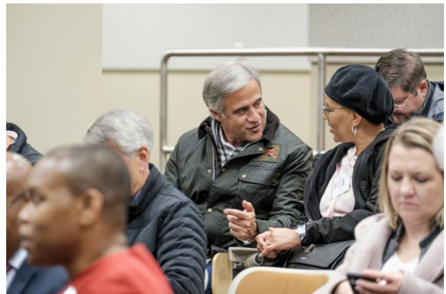
Wilmington Mayor Bill Saffo and Durham Mayor Elaine O'Neal