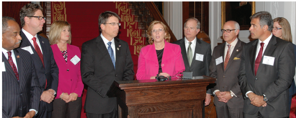
Members of the Metropolitan Mayors Coalition hold a press conference with Governor McCrory as part of the group's November meeting in Raleigh.