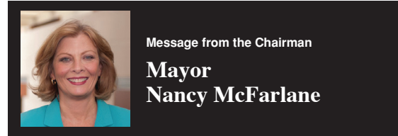
Message from the Chairman

Local control is at the heart of our metro region's success. North Carolina is a state of great diversity of its people, geography and its values. Local control allows each region to build a community that reflects their local culture and values. Our history of doing so is paying great dividends as evidenced in the release of the census data last week. What we are doing at the local level is working. Our mayors – all our locally elected leaders – are committed to continuing our track record of success.