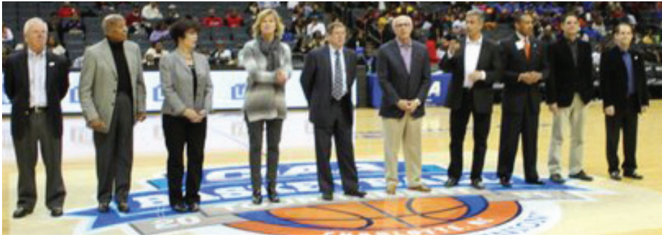
Metro Mayors are recognized at the CIAA Tournament during the Annual Meeting in Charlotte.