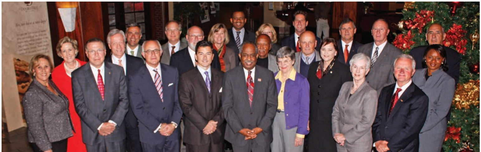
The Metro Mayors celebrate the group's 10th anniversary.