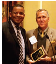
Charlotte Mayor Anthony Foxx presents House Speaker Thom Tillis with a Legislative Award for balancing the budget without taking local revenues.