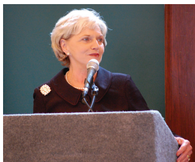
Governor Bev Perdue delivers the keynote address at "Seamless Solutions to Urban Crime" in August.