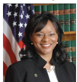
Asheville Mayor Terry Bellamy

Asheville Mayor Terry Bellamy was one of 34 members named by Gov. Bev Perdue to the StreetSafe Task Force. StreetSafe brings together faith-based organizations, non-profits, local and state government agencies, business leaders and members of the community to develop a plan to combat recidivism and reintegrate offenders safely into the community.