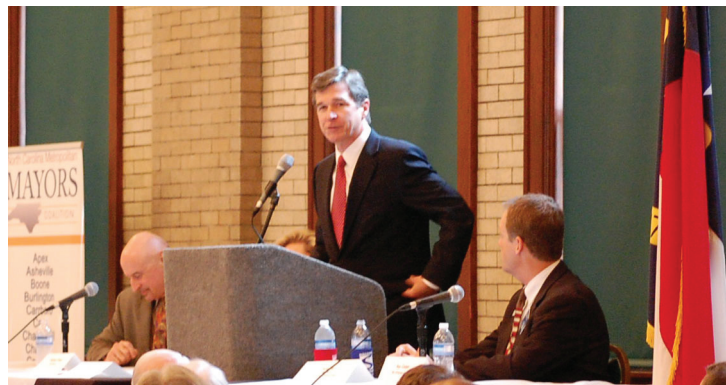
Attorney General Roy Cooper speaks about the dangers of gang violence at the Metro Mayors' public safety summit.