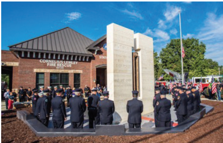
Nearly one thousand community members and first responders from around the country attended the dedication of the Cornelius 9/11 Monument.