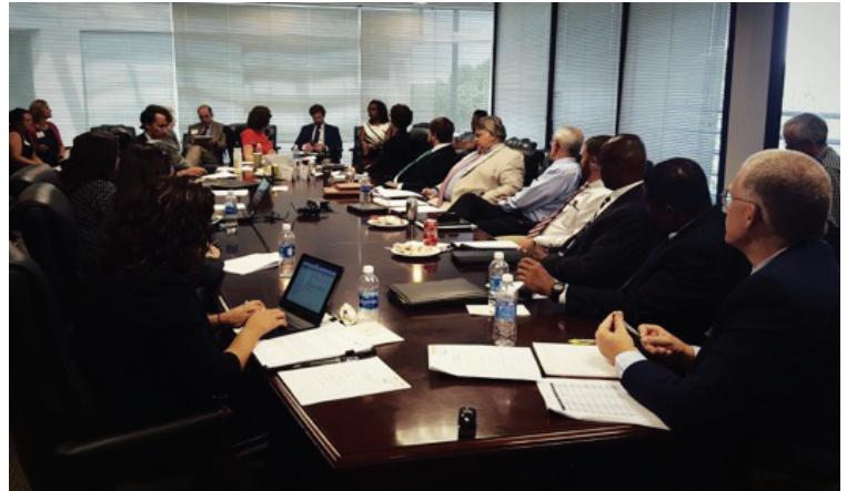
Metro Mayors member-city staffers met in September to discuss shared concerns and opportunities in the coming months.